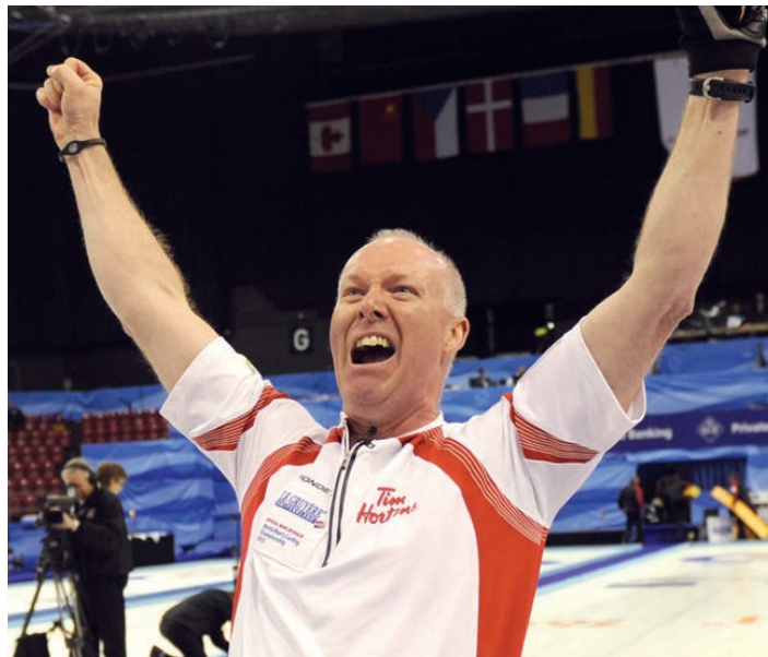
Canada's Glenn Howard is one of the country's most decorated curlers, winning four world titles, twice while playing third for his brother, Russ Howard, and twice as a skip.