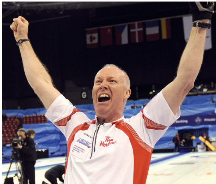
Canada's Glenn Howard is one of the country's most decorated curlers, winning four world titles, twice while playing third for his brother, Russ Howard, and twice as a skip.