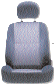
height adjustable driver's seat