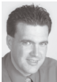
By Barre Campbell